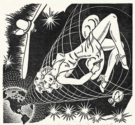
Suddenly the chorine was able to fathom all time, all space, and infinity