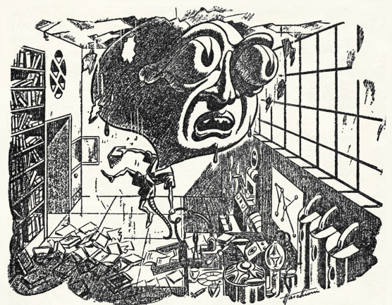
Yooggi's body zoomed upward and his head crashed through the skylight