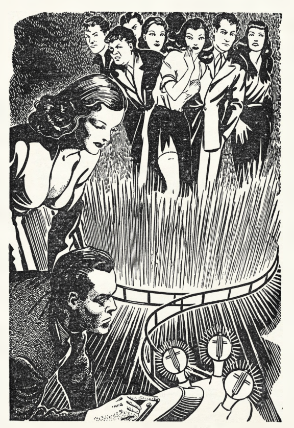
As they babbled desperate promises, Brett pressed the button 1.3\,