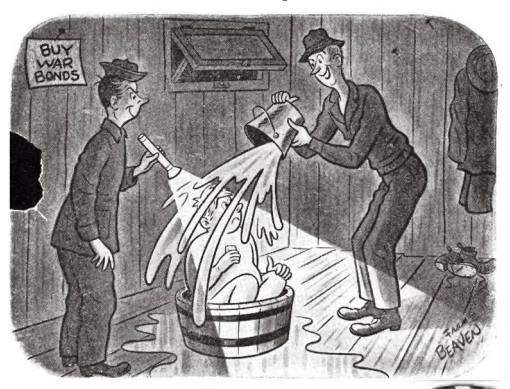
"Your bawth is drawn, m'Lord!"

IF YOU ARE finding it difficult to buy "Eveready" flashlight batteries this is the reason. Nearly all we make are going to the Armel Forces and to essential war industries. This leaves very few of these long-life, dependable flashlight batteries for civilian consumers.